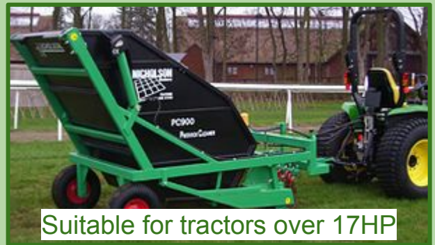
Suitable for tractors over 17HP

The machine cleans grass up to 4 inches without rakes engaged and up to 8 inches with rakes engaged. The rakes provide light scarifying, removing weeds and trash, to rejuvenate the paddock. Used regularly, the Nicholson Paddock Cleaner will enhance paddocks with a striped effect.