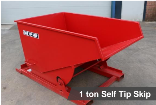
1 ton Self Tip Skip