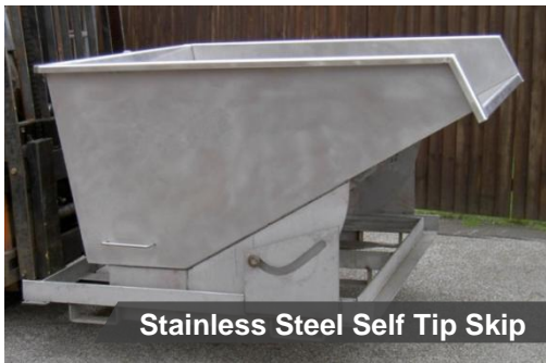
Stainless Steel Self Tip Skip