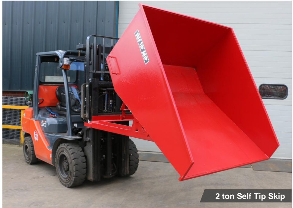
2 ton Self Tip Skip

Tong Self Tip Skips are the ideal solution for collecting general waste & keeping your premises tidy