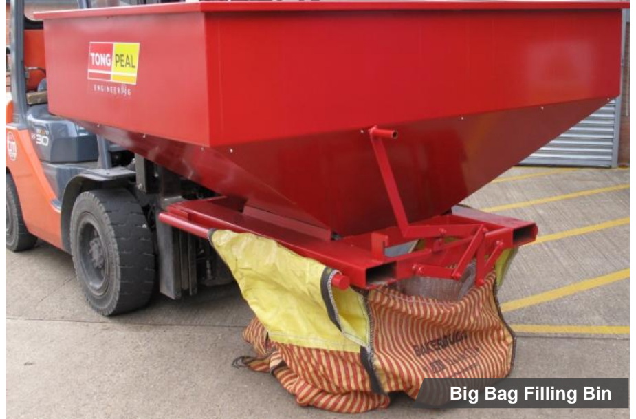
Big Bag Filling Bin