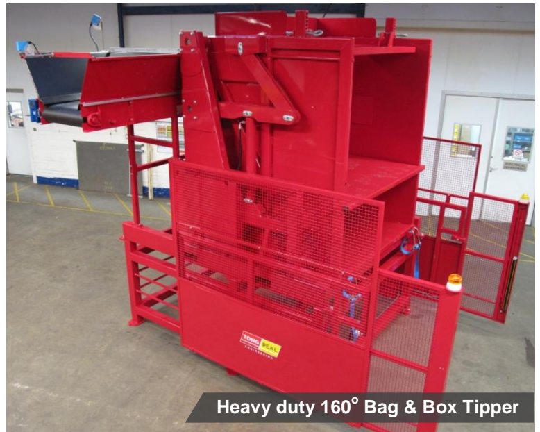
Heavy duty 160° Bag & Box Tipper