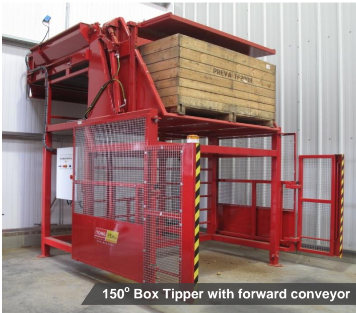
150° Box Tipper with forward conveyor