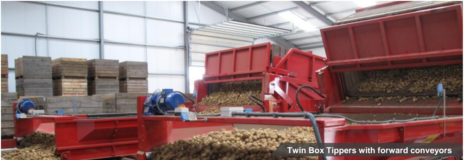
Twin Box Tippers with forward conveyors