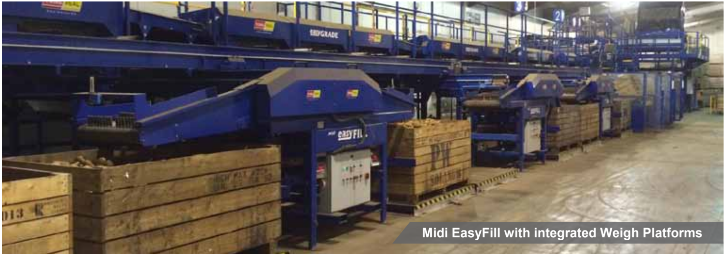
Midi EasyFill with integrated Weigh Platforms