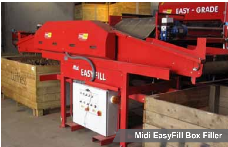
Midi EasyFill Box Filler